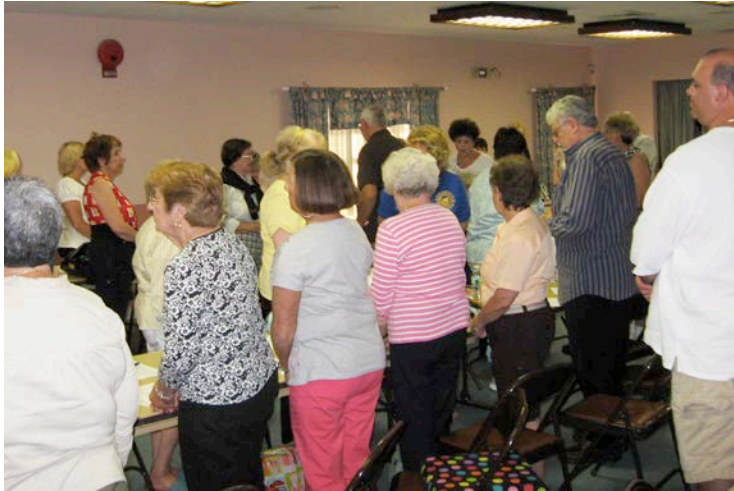
MEMBERS GIVE THEIR ATTENTION TO OUR CHAPLAIN AS WE BEGIN