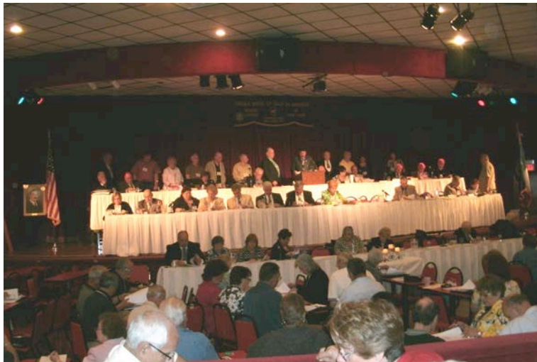
STATE AND NATIONAL OFFICERS PRESIDED OVER CONVENTION HALL