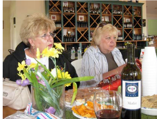
FRIENDSHIP & RELAXATION