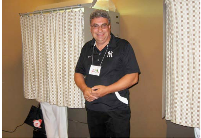
DELEGATES USED REAL N.Y.S. VOTING MACHINES TO CAST THEIR BALLOTS ON SATURDAY