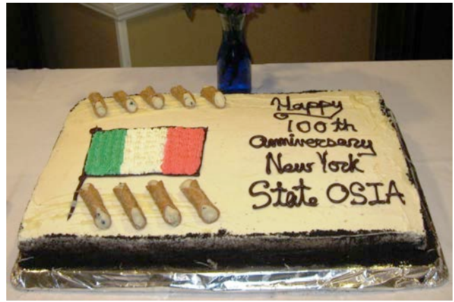
THERE WAS A BIRTHDAY CAKE TO COMMEMORATE THE NEW YORK GRAND LODGE'S 100 TH ANNIVERSARY