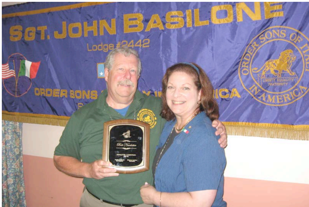
TAKING TOP PRIZE IN THE STATE NEWSLETTER COMPETITION, WHEN OUR NEWSLETTER "IL GIORNALINO BASILONE" WAS JUDGED "BEST NEWSLETTER IN NEW YORK STATE"