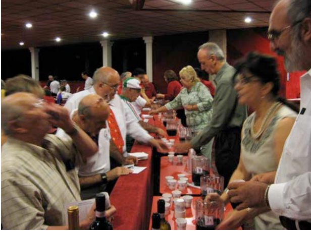
DELEGATES FROM ACROSS THE STATE SAMPLE ENTRIES DURING HOMEMADE WINE CONTEST