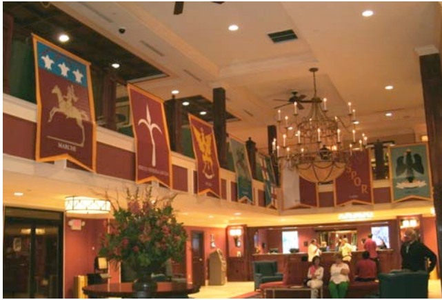
FLAGS FROM EVERY REGION OF ITALY WERE DISPLAYED IN VILLA ROMA'S MAIN LOBBY