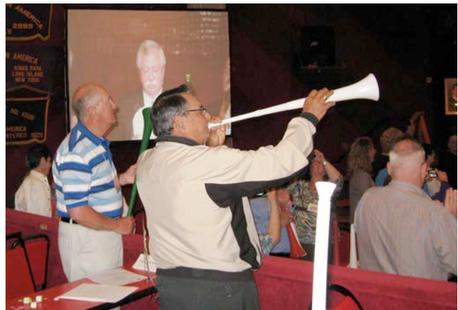
OUR DELEGATES JOIN 360 OTHERS, MAKING SOME NOISE TO WELCOME THE NEW STATE LEADERS