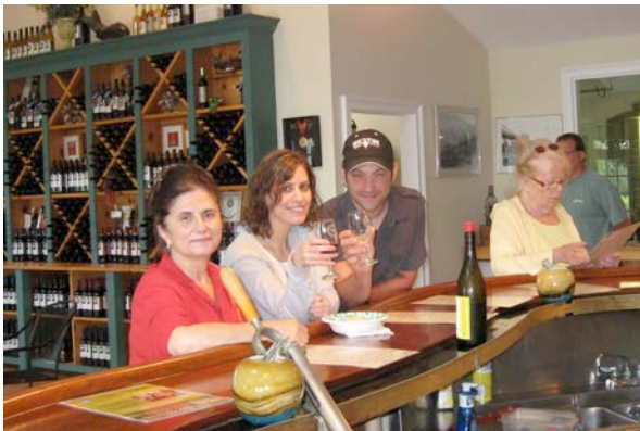
WINE TASTING ...