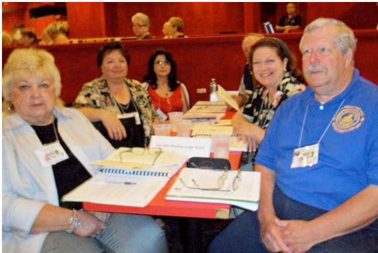
YOUR LODGE DELEGATES WORKED HARD – MANY HOURS EVERY DAY