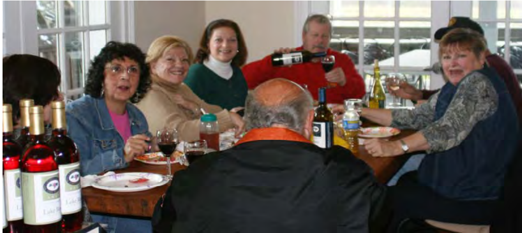
ONCE AGAIN THERE WAS PLENTY TO EAT . . .