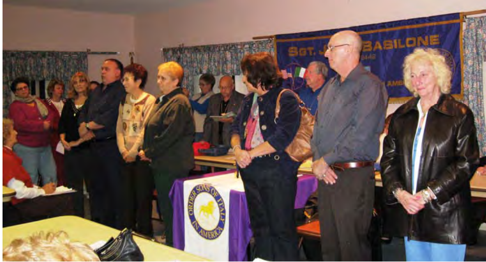
OUR NEWEST MEMBERS ARE INTRODUCED . . .