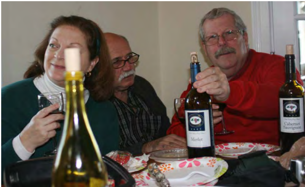
PLENTY TO DRINK . . .