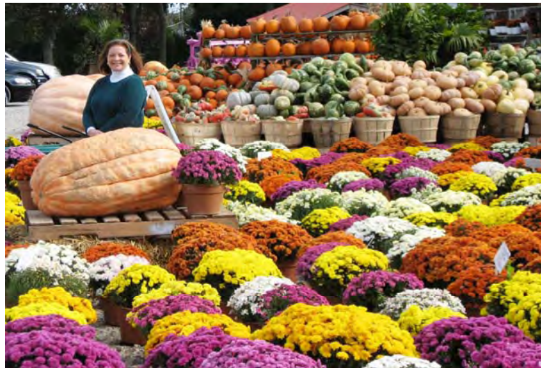
FLOWERS . . .