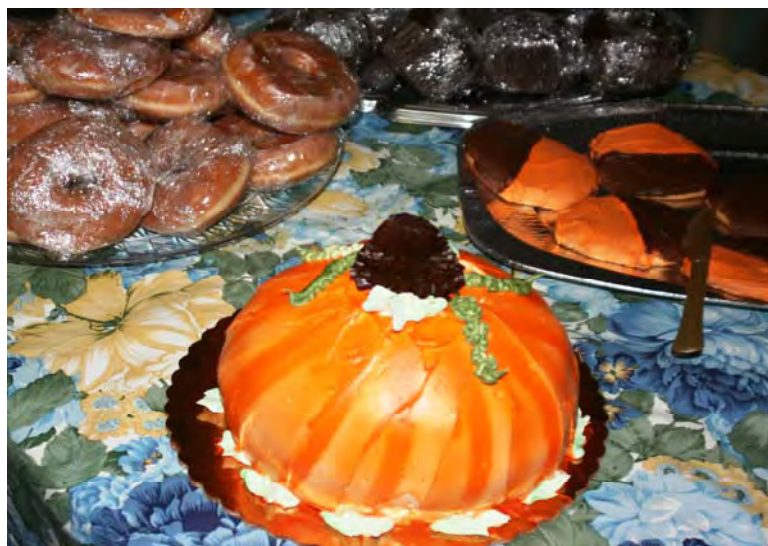
AND PLENTY OF PUMPKIN TREATS FOR ALL