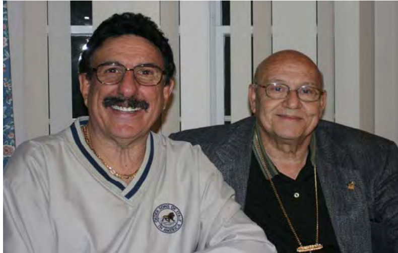
TWO FAMILIAR FACES . . .