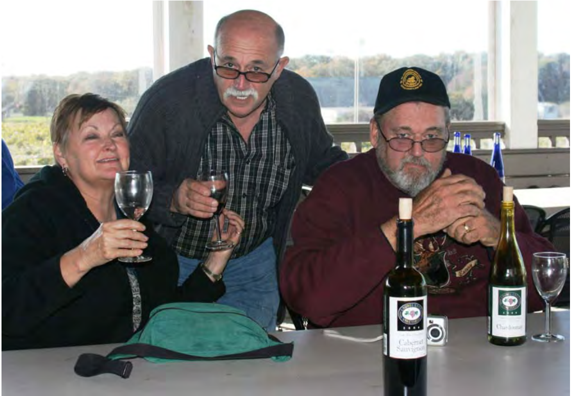
PLENTY TO TOAST ...