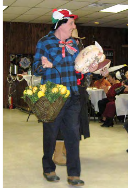
AND OTHER STRANGE GUESTS