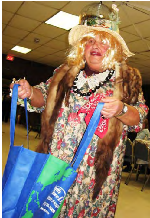
THERE WERE INLAWS