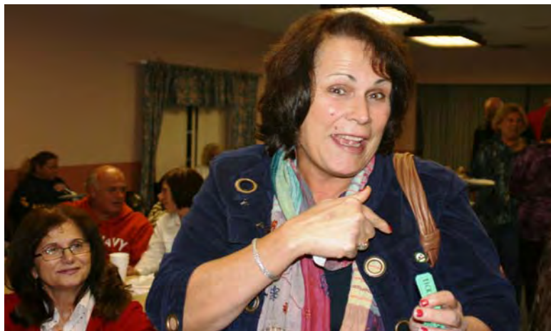
OUR LUCKY 50 / 50 WINNER . . .