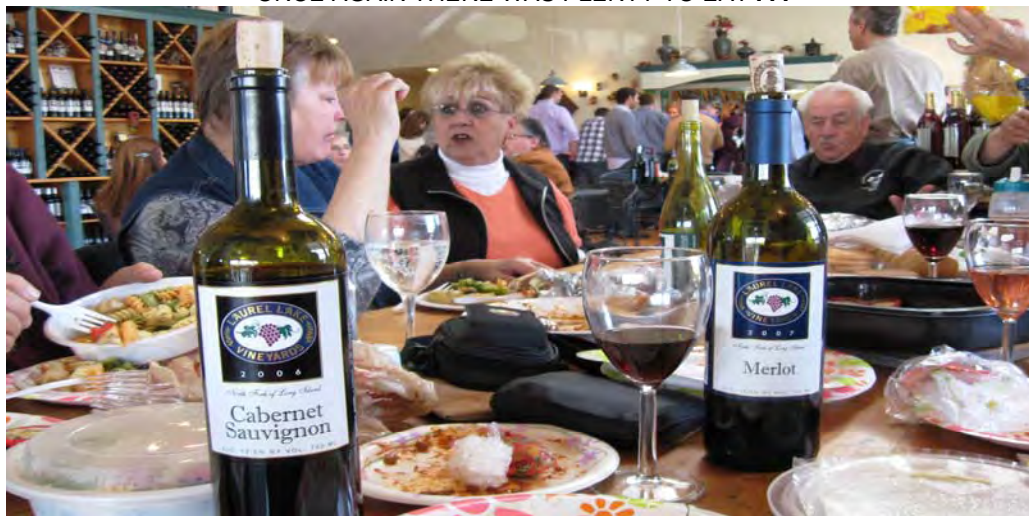
PLENTY TO TALK ABOUT . . .