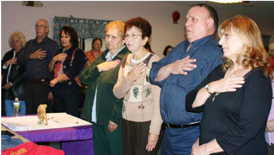
AND ARE INITIATED INTO OUR LODGE