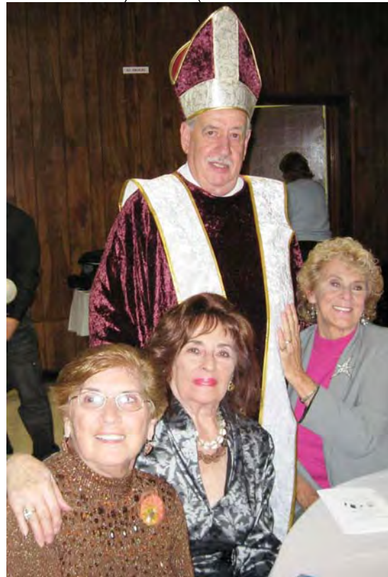
AND A PERSONAL BLESSING FOR SOME OF OUR LODGE MEMBERS IN ATTENDANCE!