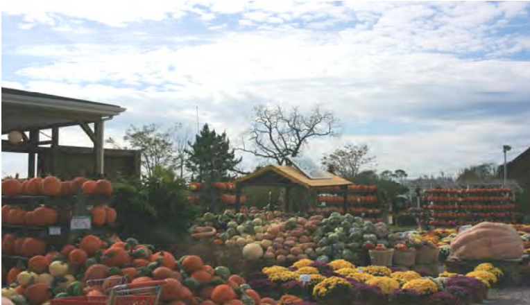
FARM STANDS . . .