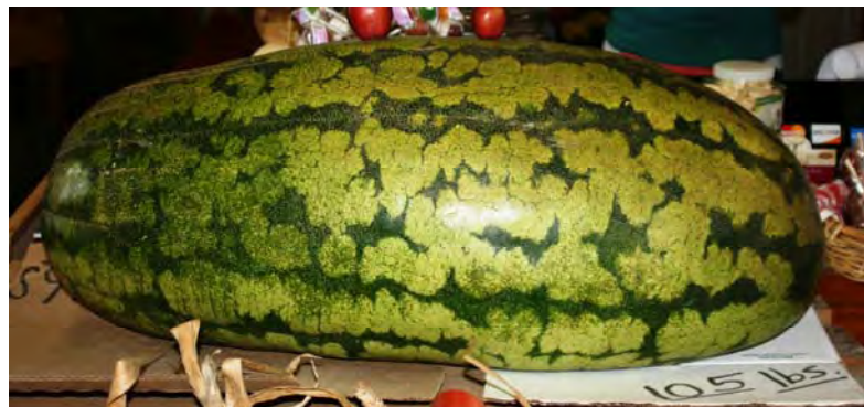
AND 105 POUND WATERMELONS WERE ENCOUNTERED EN-ROUTE TO LAUREL LAKE VINEYARD ON THE NORTH FORK OCTOBER 23 RD