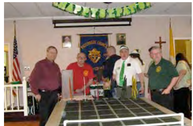
LINED THEM UP AT THE STARTING LINE . . .