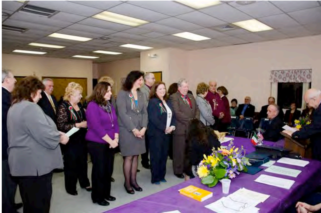
OUR OUTGOING OFFICERS ARE THANKED FOR THEIR SERVICE