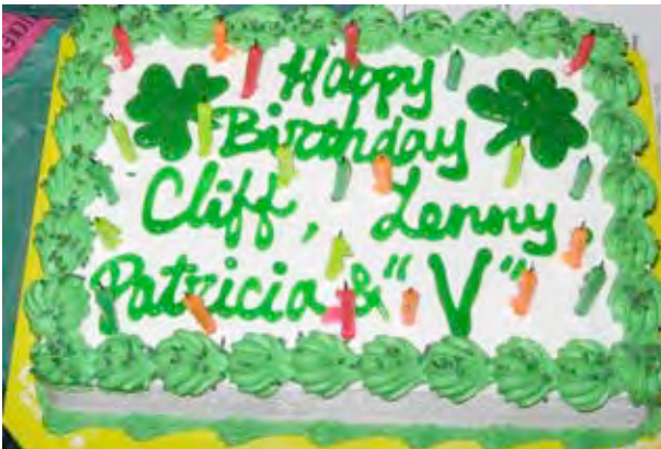
CELEBRATED A FEW MARCH BIRTHDAYS . . .