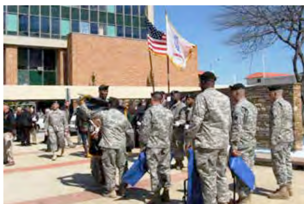
GUNNERY SGT JOHN BASILONE WAS REMEMBERED DURING MEDAL OF HONOR DAY CEREMONIES AT LONG BEACH TOWN HALL ON MARCH 25 TH . OUR BANNER WAS PLACED ON THE STAGE IN FRONT OF MEDAL OF HONOR RECIPIENTS' PHOTOS (L), FOLLOWED BY MULTI-UNIT MILITARY HONORS OUTSIDE.