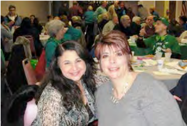
MORE THAN 40 LODGE MEMBERS ATTENDED