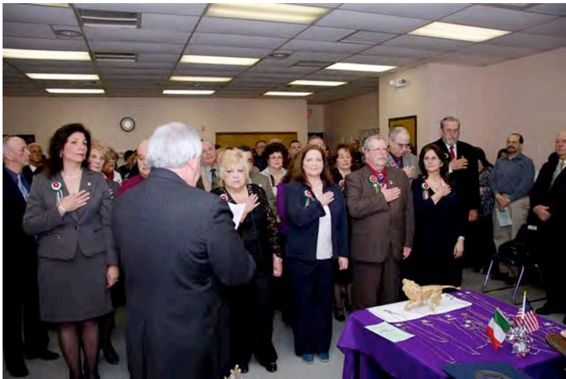
2011-2012 LODGE OFFICERS ARE SWORN IN