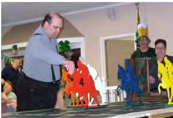
RAN THE HORSES DOWN THE TRACK . . .