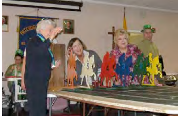
WE ROLLED THE DICE . . .