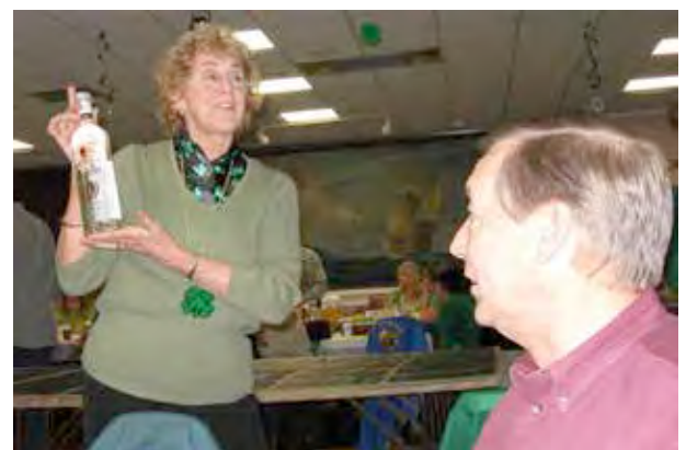
AND WE WON A FEW RAFFLES TOO!